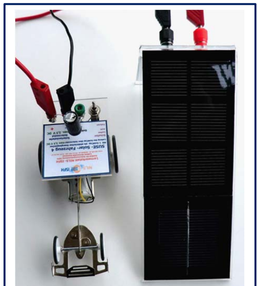
The solar vehicle 4 with the solar filling station (solar module) SUSE 4.34 (2.4V/ 630 mA) Below the circuit board the solar electric motor is visible (with wires yellow/black)

The solar module SUSE 4.34 is especially suited. For testing purposes the GoldCap can also be charged with a 1.5 \text{ V} battery. The vehicle and also the solar module are available as construction kits or finished devices from NILS-ISFH or SUNdidactics.