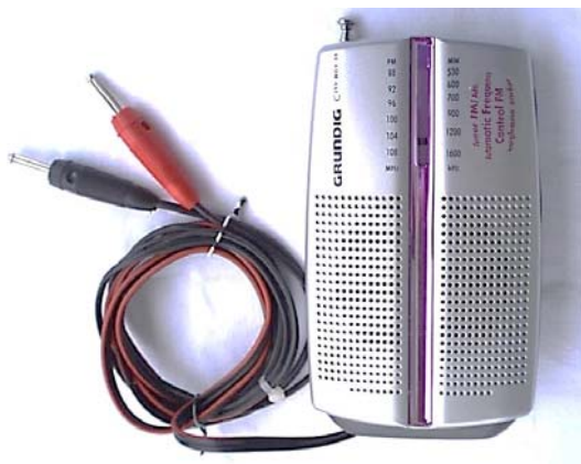
Solar- Radio SUSE 4.36

To be connected to the charging module SUSE 4.17 with USB output 5V DC