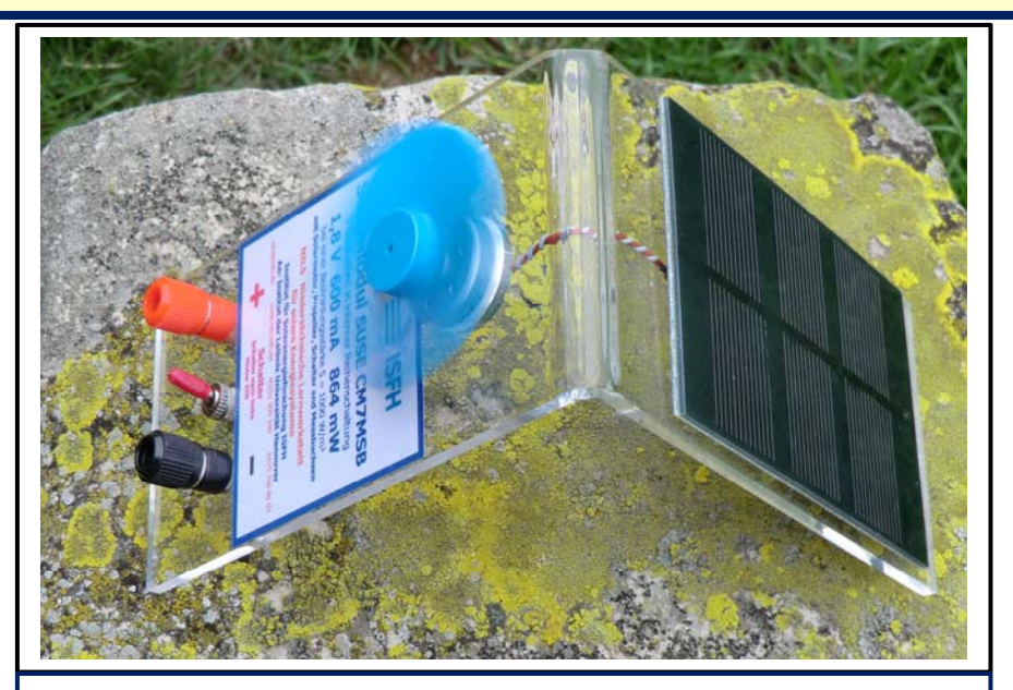
View from above onto the solar module SUSE CM7MSB

Especially suited for student-centered experimental classes in ISCED levels 1-2